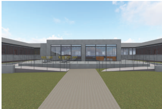
Architect's renderings of planned village in Betty's Bay.

14 single story two-bedroom apartments and communal sun room / dining room / lounge.