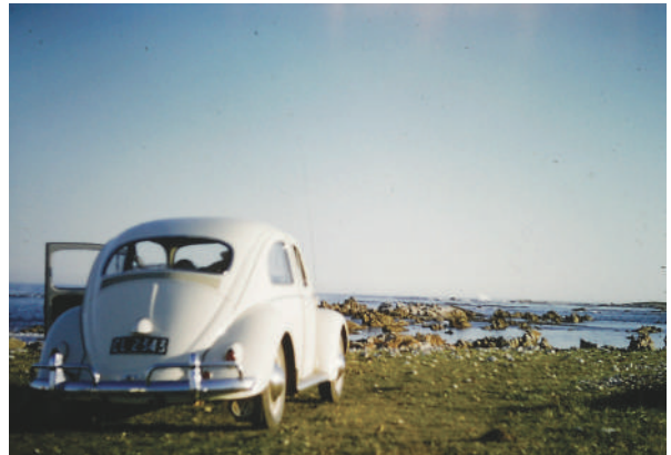
See you at the beach...

Holistic Care & Bespoke Therapy Dementia Recreational Program Respite Care Day Care Praise & Worship Memory Café Dementia Training & Workshops Dementia Care Consulting AD-Venture Sensory Therapy 24-Hour Nursing Reminiscence Therapy